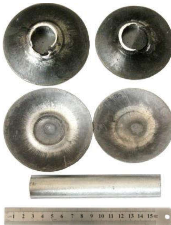
Fig. 2 Initial billet of AM60 and dish-shaped samples fabricated by spread extrusion.

Both the initial and final samples of AM60 magnesium alloy before and after the spread extrusion process are depicted in Fig. 2. It clearly shows that this process can produce samples in which cylindrical billets changed to the final dish-shaped samples.