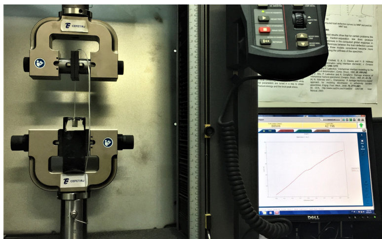
Fig. 3. Instron machine and RTC clamp

The Instron machine, model 5966, with a load cell of 10 kN, was used in the laboratory of composites and adhesives (LADES) of CEFET/RJ. This machine needed to be adapted with a Restrained Top Constraint (RTC) clamp for anchoring the specimens and performing the pull-out test (Fig. 3). In addition to assisting in fixing the block of the test piece, the clamp has a sufficient opening for the passage of the fiber. The use of the RTC